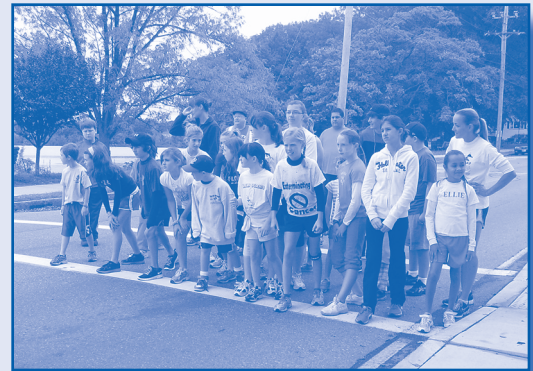
1-mile Fun Run starting line